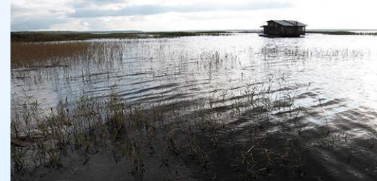
Lake Engure Ramsar Site, Latvia